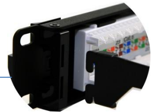
Easy to install cable management